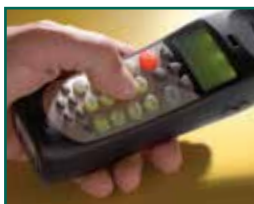
grant guest access by pressing 9 on the telephone