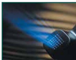
full duplex Hi quality communication – the same standard that the phone company uses