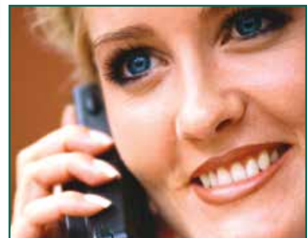
talk to front door or gate from any telephone in the home