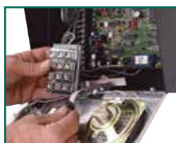
modular design makes installation and service easy