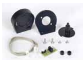
Encoder for 740 D (*)