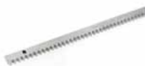
Galvanised rack 30x12 mod. 4 with weld-on fittings (4 m package)