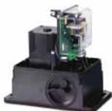
Built-in control board 740 D Technical specifications page 152