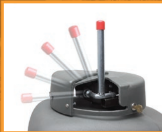
Easy to Operate manual release