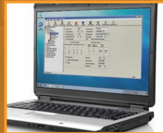
Gate Tracker™ record users access