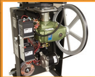
Steel Frame for strength and durability